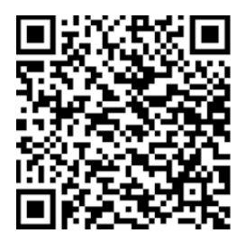
Roller Blinds Fabric Specifications