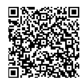
Roller Blinds Fabric Specifications