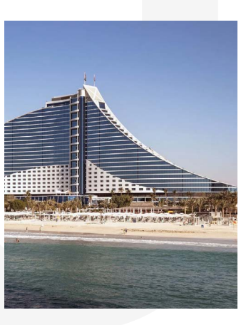
Jumeirah Beach Hotel - Dubai