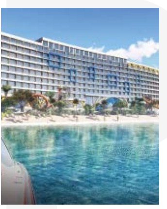
Nakheel Island - Dubai