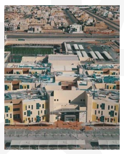
300+ Government Schools, Musanada - Abu Dhabi