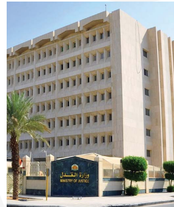
Ministry of Justice - Riyadh