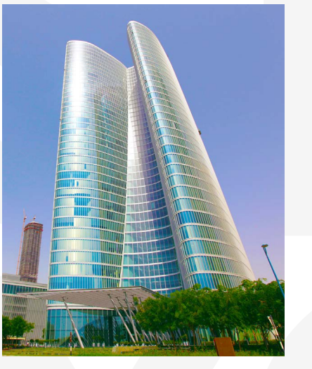
Abu Dhabi Investment Authority - Abu Dhabi

Here are some highlights of our completed projects, illustrating our extensive reach and expertise. These projects showcase our ability to deliver quality and excellence across various sectors, including aviation, hospitality, healthcare, corporate, residential, and industrial.