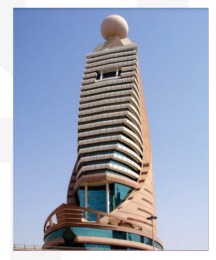
Etisalat Tower - Dubai