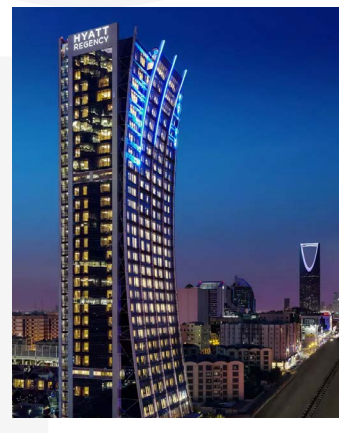
Hyatt Regency - Riyadh