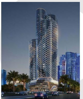
Swiss Hotel Doha - Qatar