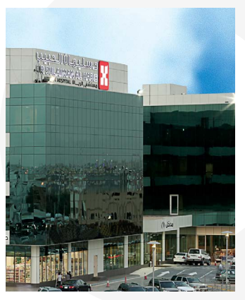
Dr. Sulaiman Al Habib Hospital -Dubai