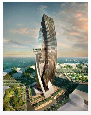
JW Marriott Hotel - Qatar