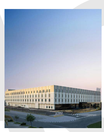
Avani Muscat Hotel & Suites -Muscat Oman