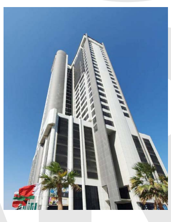
S Hotel Manama - Bahrain