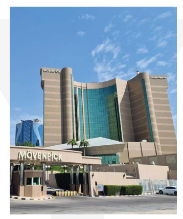
Movenpick Hotel Al Khobar - KSA