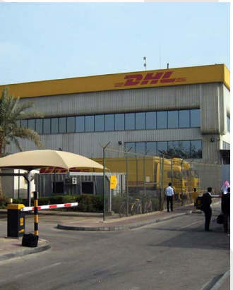
DHL - Bahrain