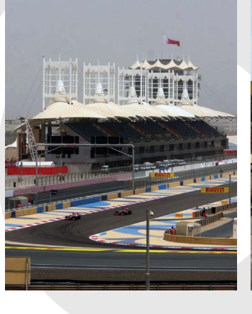
Bahrain Grand Prix