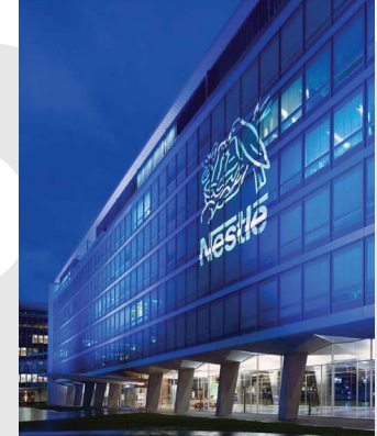
Nestle Waters - Bahrain