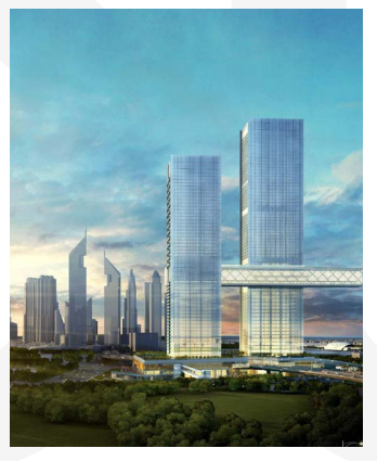
One Za'abeel Ithra - Dubai