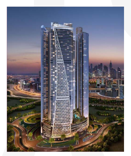
Paramount Towers Damac - Dubai