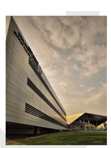
King Hamad Hospital -Bahrain