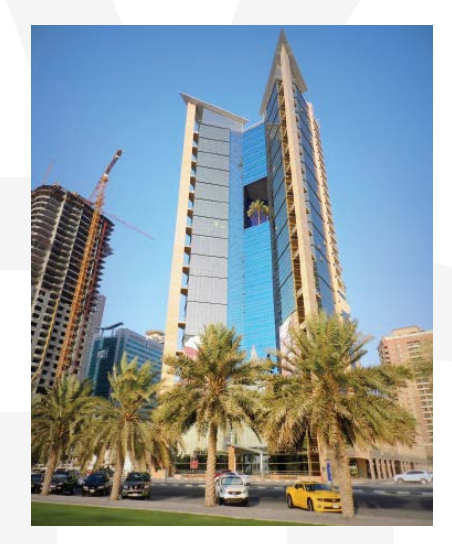
Islamic Bank - Sharjah