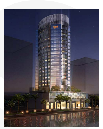
Kempinski Residences - Dubai