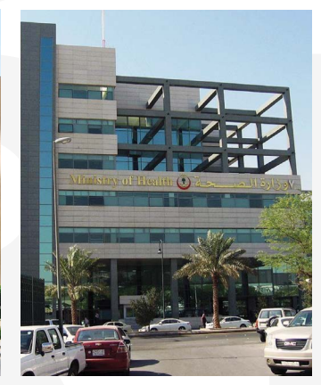
Ministry of Health - Riyadh