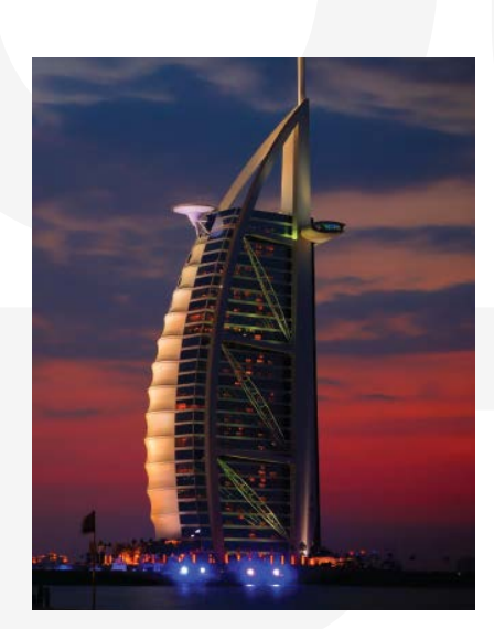
Burj Al Arab - Dubai